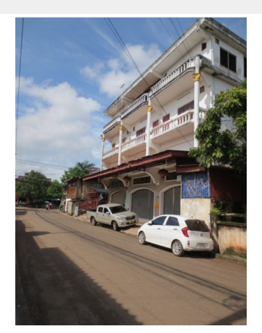
House For Sale