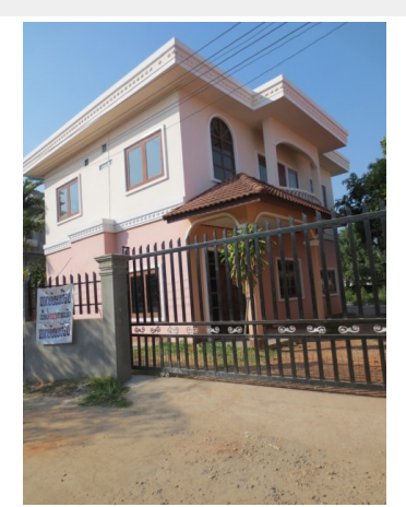
House for Sale